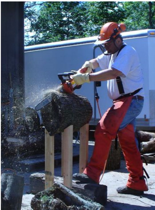
Chain Sawen at Bills Nice Burls.