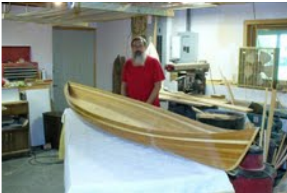
Nice looking Craft Mike