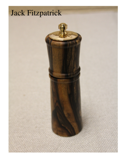
December 2014 Instant Gallery