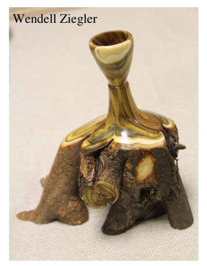
More December Gallery Pictures