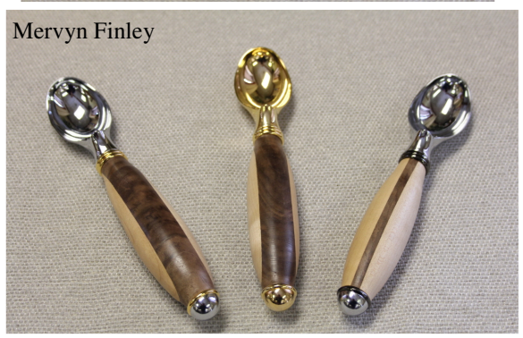
More January Gallery Pictures