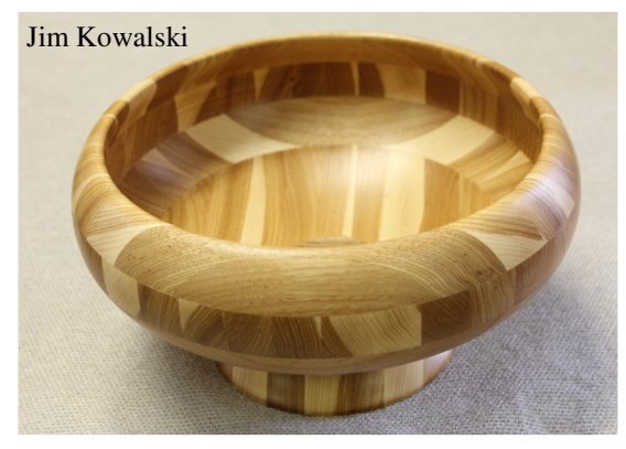
January 2015 Instant Gallery