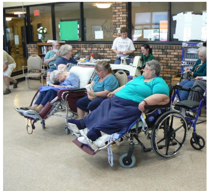
Photos From CRW Demonstration Bethany St. Joseph La Crosse, WI July 18th